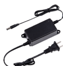
PFM320 12V 2A Power Adapter