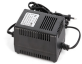
AC24V/3A Power Supply