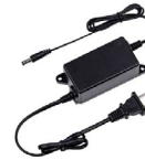
DC12V/2A Power Adapter