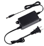
DC12V/2A Power Adapter