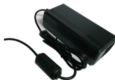
DC36V power adapter