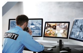
Security Guard Service