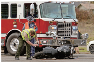
Police Law Enforcement