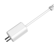
LR1002 ePoE Over Coax Converter