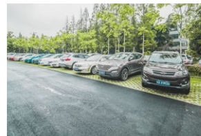
Hotels and Casinos