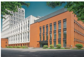
Universities and Campuses