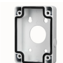
PFA120 Junction Box