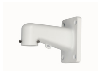
PFB305W Wall Mount Bracket