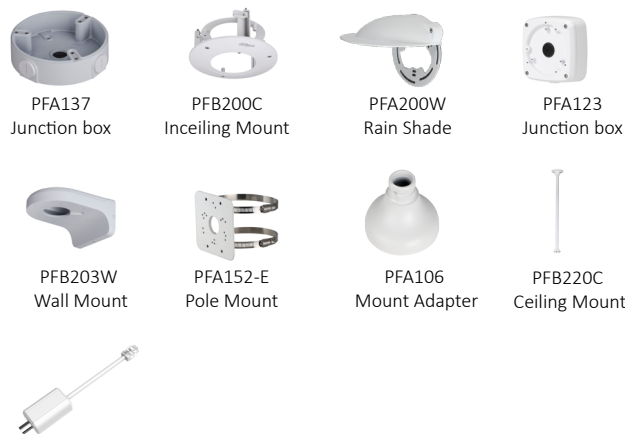
LR1002 ePoE Over Coax Converter